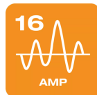
Connects to any 16A (3 phase) charging unit or station with a type 2 connection.

Charge at home and on the move Type 2 to Type 2 PIN | 3PHASE